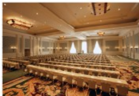
All of the events and CEUs will take place in the beautiful on-site meeting facilities.

At ASID Florida North's Chapter Weekend 2009 in Orlando: